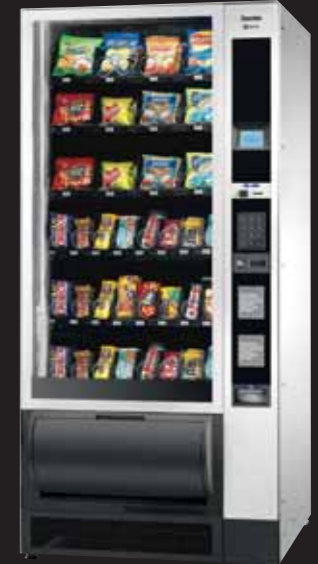
All snack version